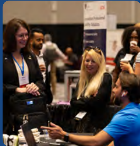
Exhibit Package Includes