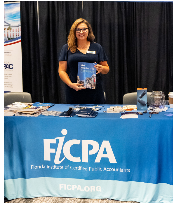
EXHIBIT PACKAGE $1,500

This sponsorship must be sold by March 22 to ensure lanyard fulfillment.